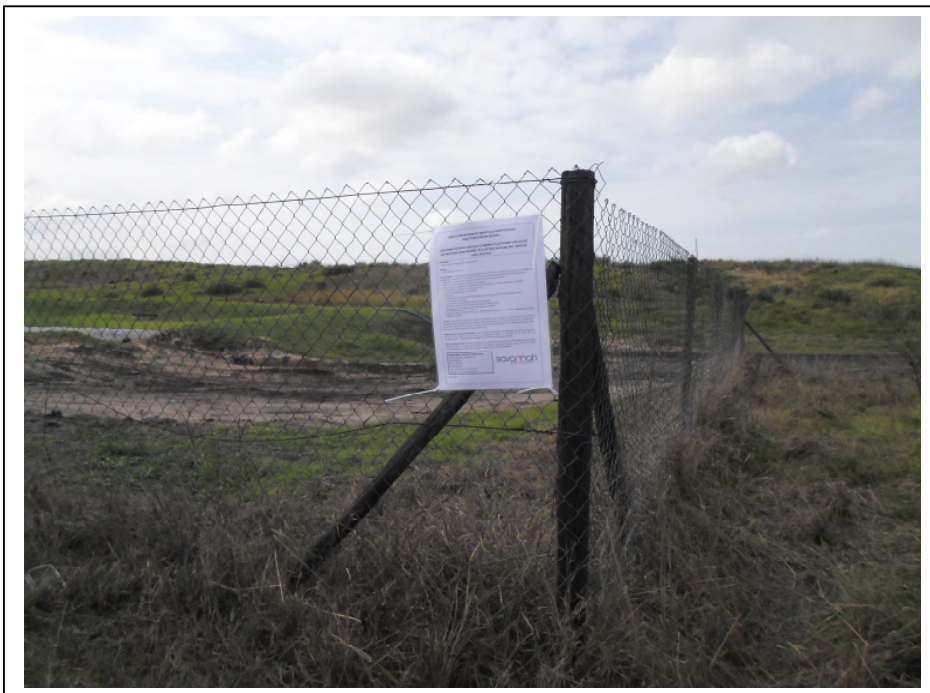
Figure 1a & 1b: Site notices placed on the boundary of Portion 2 of Erf 11376 in the Richards Bay Industrial Development Zone (IDZ) Phase 1D (30° 20' 5.85"S; 25° 41' 58.99"E)